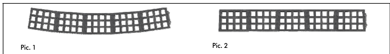
Pic. 1 Installation in turns; Pic. 2 Straight line installation